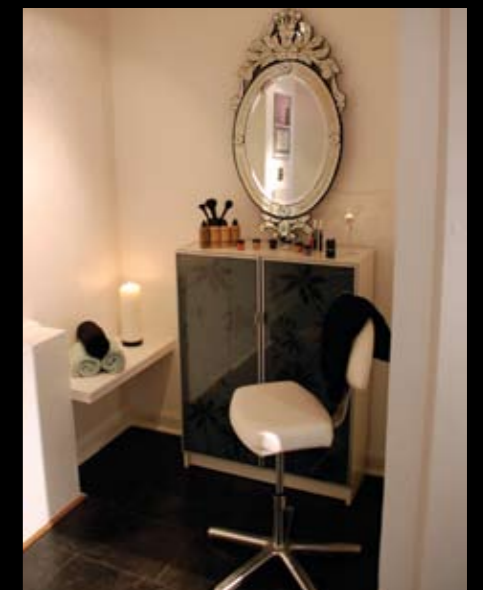
Clockwise from top left: Waiting area, The Greenroom’s dedicated St Tropez spray tanning room, Nail Bar, Make-up Bar. Main: Treatment room No. 1

In the run up to Xmas this will be one of the hottest vouchers in the City this year. A Free promotional taster facial valued at £20 has been offered to every reader ‘subject to availability’ in November only’. A new salon! A new team! A new message! A new you! Book now!